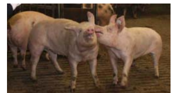
Lesion-Index (± SE) for Large White and Pietrain gilts