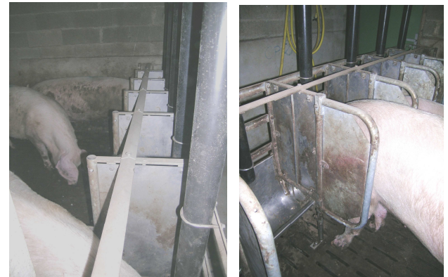
Head partitions (HP)