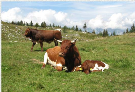
Cika cattle