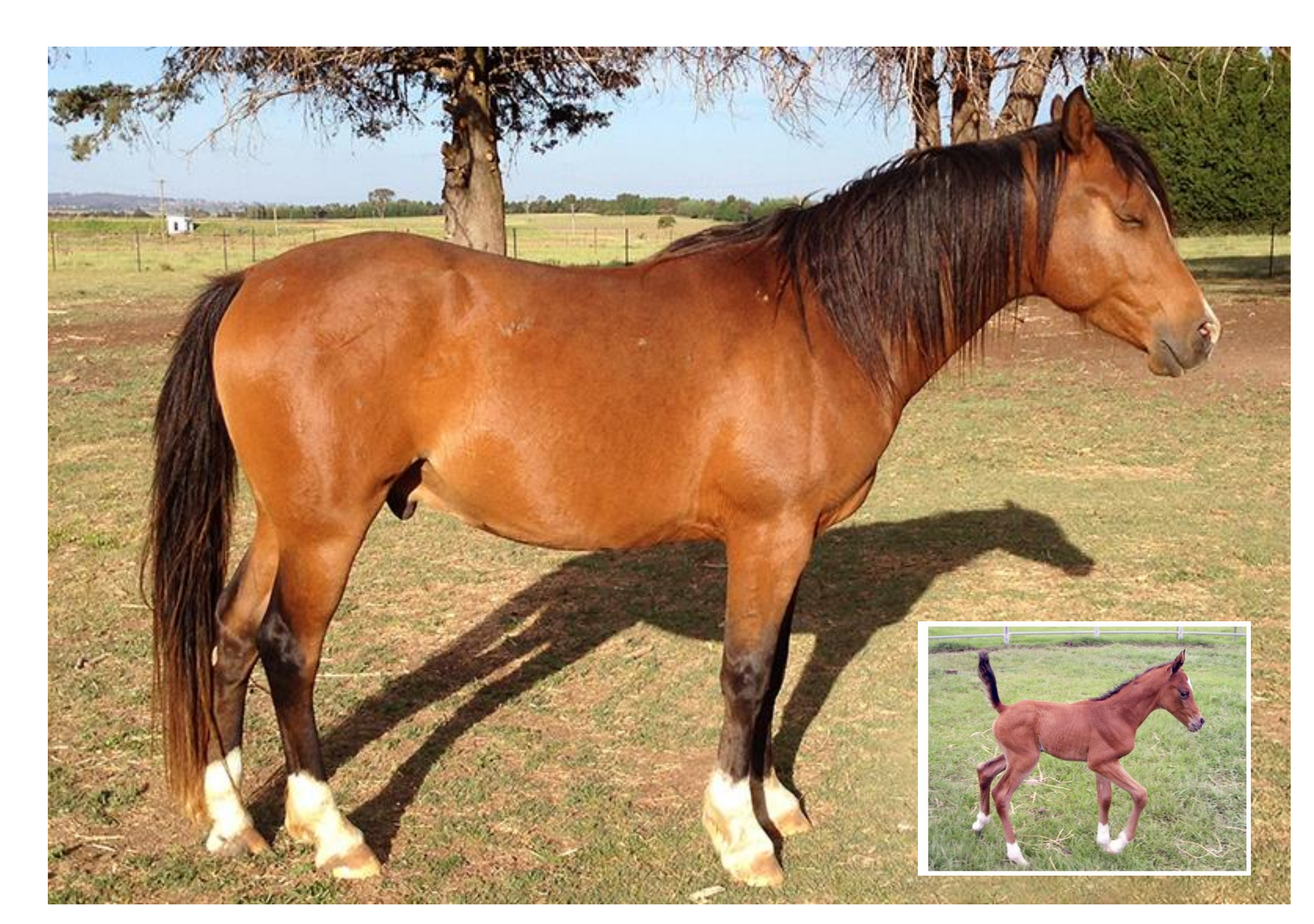
Fig 1: 4yo Arabian gelding, born prematurely at 305 d gestation.